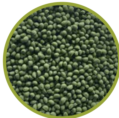
Thermoplastic elastomer (TPE)

For a typical 85,000-sq.-ft. field, the costs for quality TPE pellets can add approximately $200,000 to a project's initial costs for infill material, plus the cost for a shock pad ($85,000–$130,000). Availability of TPE can be an issue; historically it has been imported mainly from Europe, although it has recently become more available in the United States. Its maintenance requirements are similar to those for SBR.