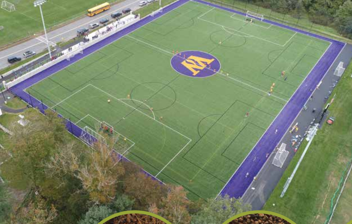
Left: One of the first fields in the United States to use an infill material that consists of crushed walnut shells and sand, The Wheeler School of Seekonk, Massachusetts.