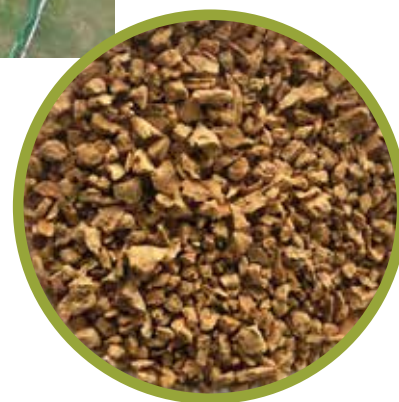
Organic Infills. Pictured left to right: Corkonut (cork and coconut husk), walnut shells, and cork.